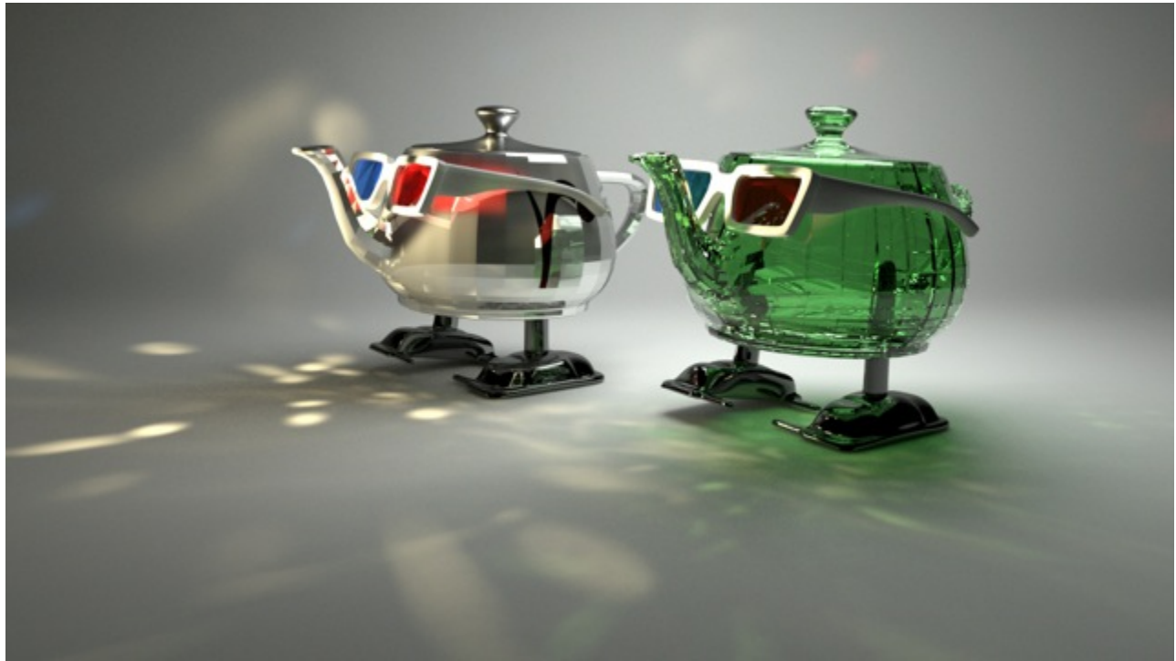
Disco teapots, rendered using the PxrVCM integrator.

Integrators take the camera rays and return results to the renderer. For the main integrators these are estimates of the light energy (radiance) from the surfaces seen from the outside along the rays. These main integrators are responsible for computing the overall light transport, that is, light that travels from a light source through your scene from object to object (or through objects and volumes) to reach the camera. Interior integrators assist in specialized cases by handling the light within surfaces or volumes. We provide three main production quality integrators, though users can substitute their own.