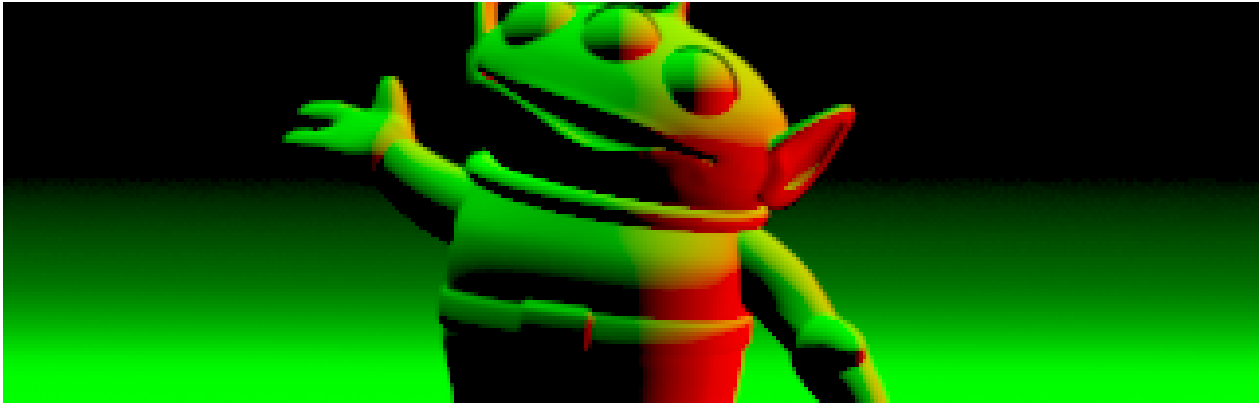
N_n (an Arbitrary Output Variable)

Producing final beauty images is the usual goal in rendering. However, it can also be useful to produce other kinds of images. RenderMan has the ability to generate multiple images simultaneously, each displaying a different result. Each image gets sent to a display driver as the last step in their rendering. Some display drivers are oriented towards batch rendering and save their images to disk in a particular format. Others are oriented towards interactive use and display their images on the screen instead.