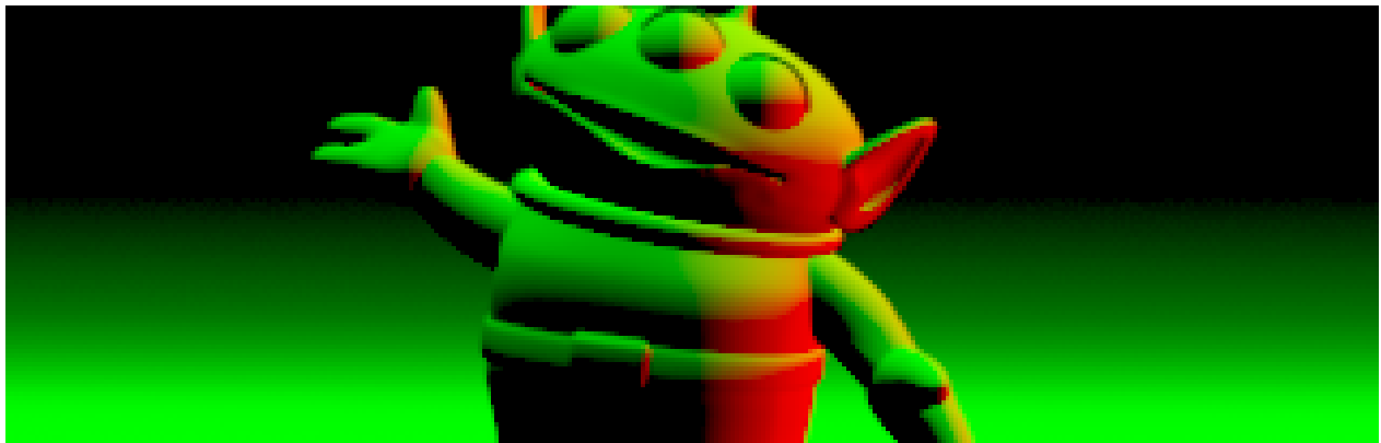
N_n (an Arbitrary Output Variable)

Producing final beauty images is the usual goal in rendering. However, it can also be useful to produce other kinds of images. RenderMan has the ability to generate multiple images simultaneously, each displaying a different result. Each image gets sent to a display driver as the last step in their rendering. Some display drivers are oriented towards batch rendering and save their images to disk in a particular format. Others are oriented towards interactive use and display their images on the screen instead.