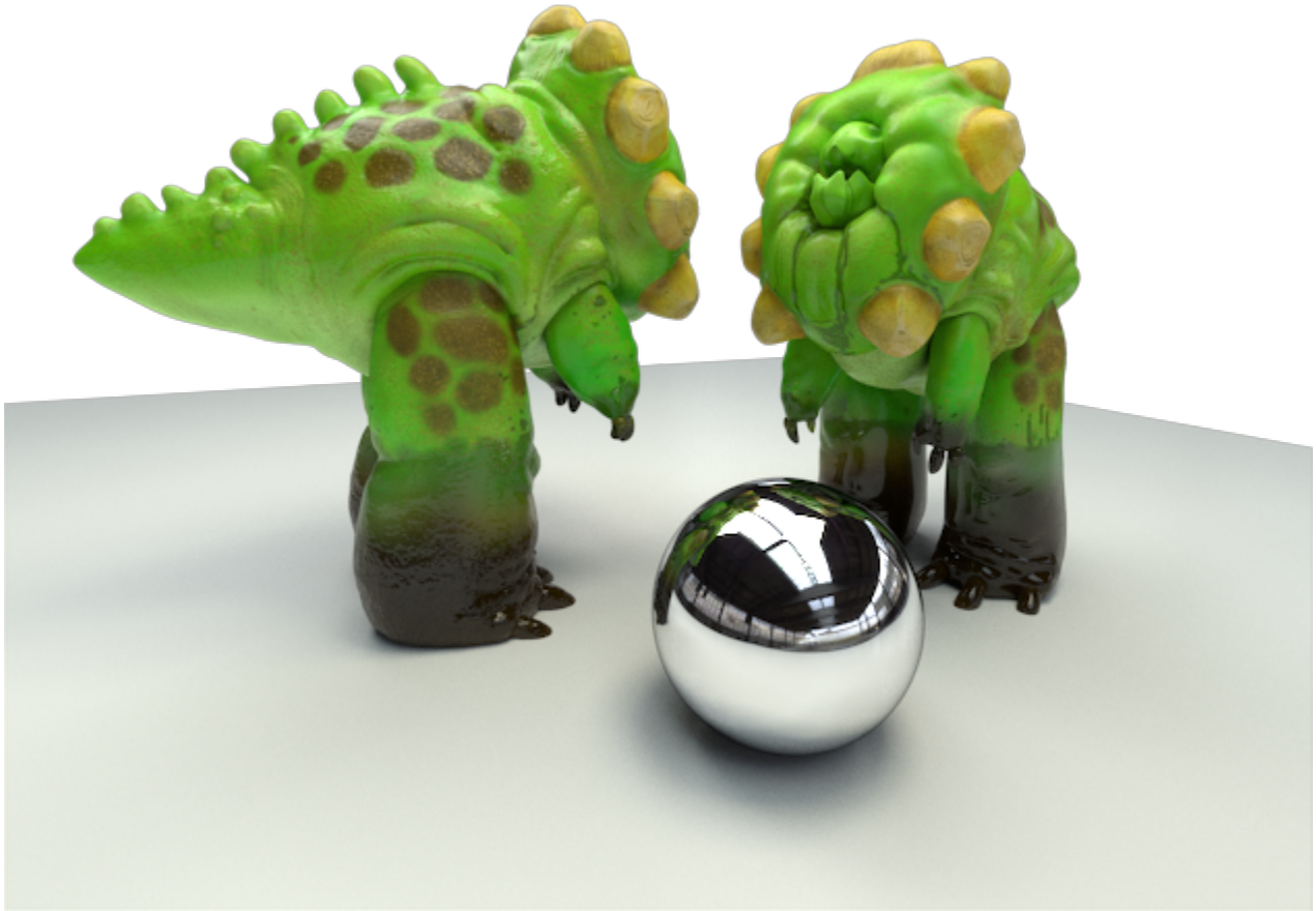
Critters, using a shading network of nine OSL shaders

RenderMan supports OSL natively with the limitations listed below .