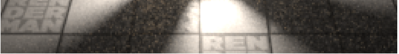
Checkpoint at 60 seconds