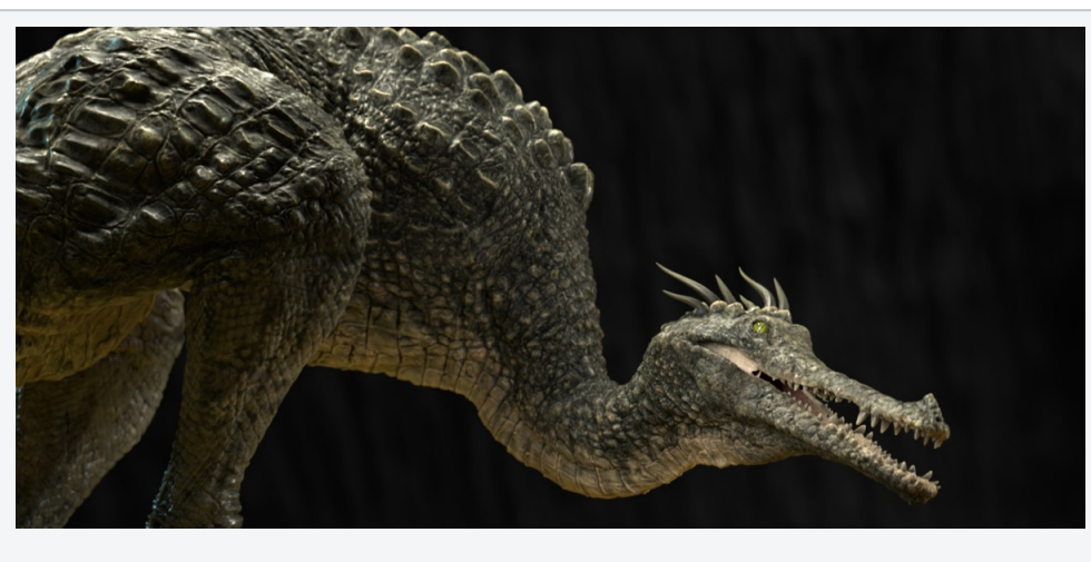
Crocostrich was created by artist Victor Besseau.