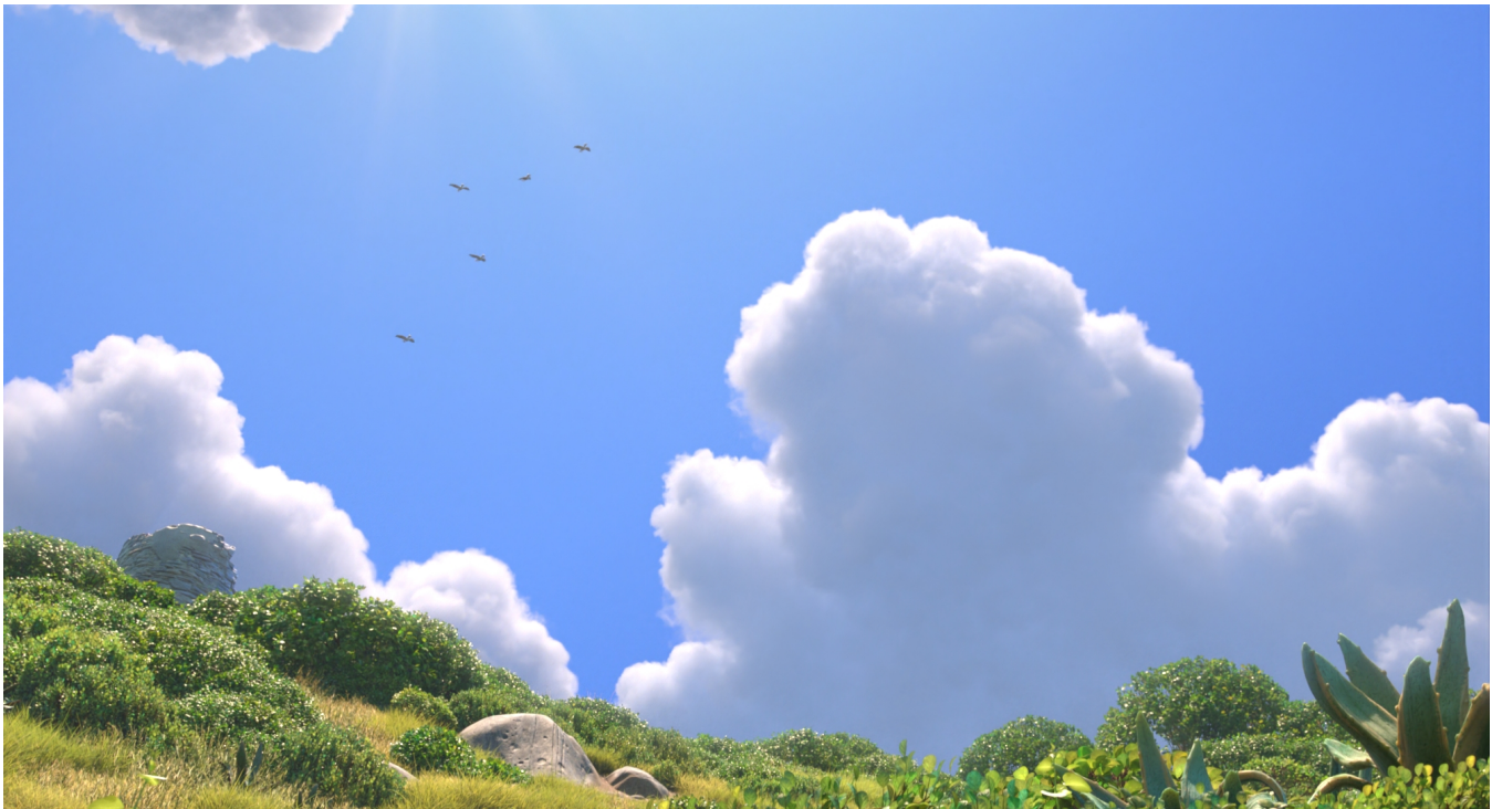
Aggregate volume composition of cloudscape vs final render - Luca