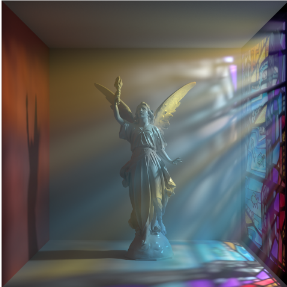
Volumetric crepuscular rays, efficiently rendered using direct lighting by means of stained glass using colored opacity

Historically, colored final opacity would only be used for transmission rays, but it is now possible for it to affect camera and indirect rays. Similarly to the explanation above, special care needs to be taken by the bxdf to make sure there is no double contribution.