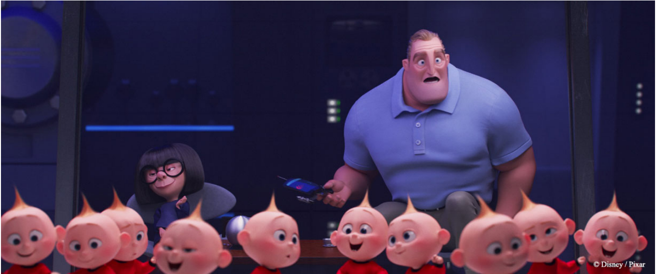
Image from Incredibles 2