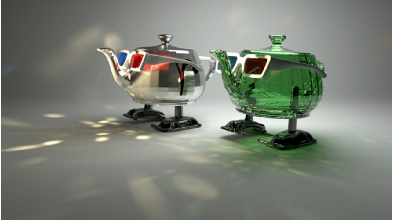
Disco teapots, rendered using the PxrVCM integrator.

Integrators take the camera rays and return results to the renderer. For the main integrators these are estimates of the light energy (radiance) from the surfaces seen from the outside along the rays. These main integrators are responsible for computing the overall light transport, that is, light that travels from a light source through your scene from object to object (or through objects and volumes) to reach the camera. Interior integrators assist in specialized cases by handling the light within surfaces or volumes. We provide three main production quality integrators, though users can substitute their own.