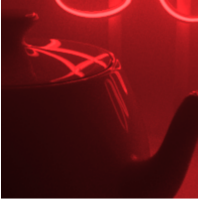
Soho - a teapot and emissive geometry in a volume, with reflections all around, this scene demonstrates improved volume sampling capabilities in a complicated lighting scenario. This example uses the PxrPathTracer integrator