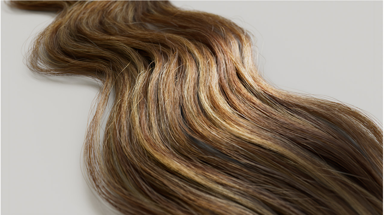
Groom & Render by Paul Sheehy

This pattern allows artists to create realistic and art directed hair and feathers that are easy to manipulate. Everything from human auburn hair to fantastical alien feathers are possible with just a few controls.