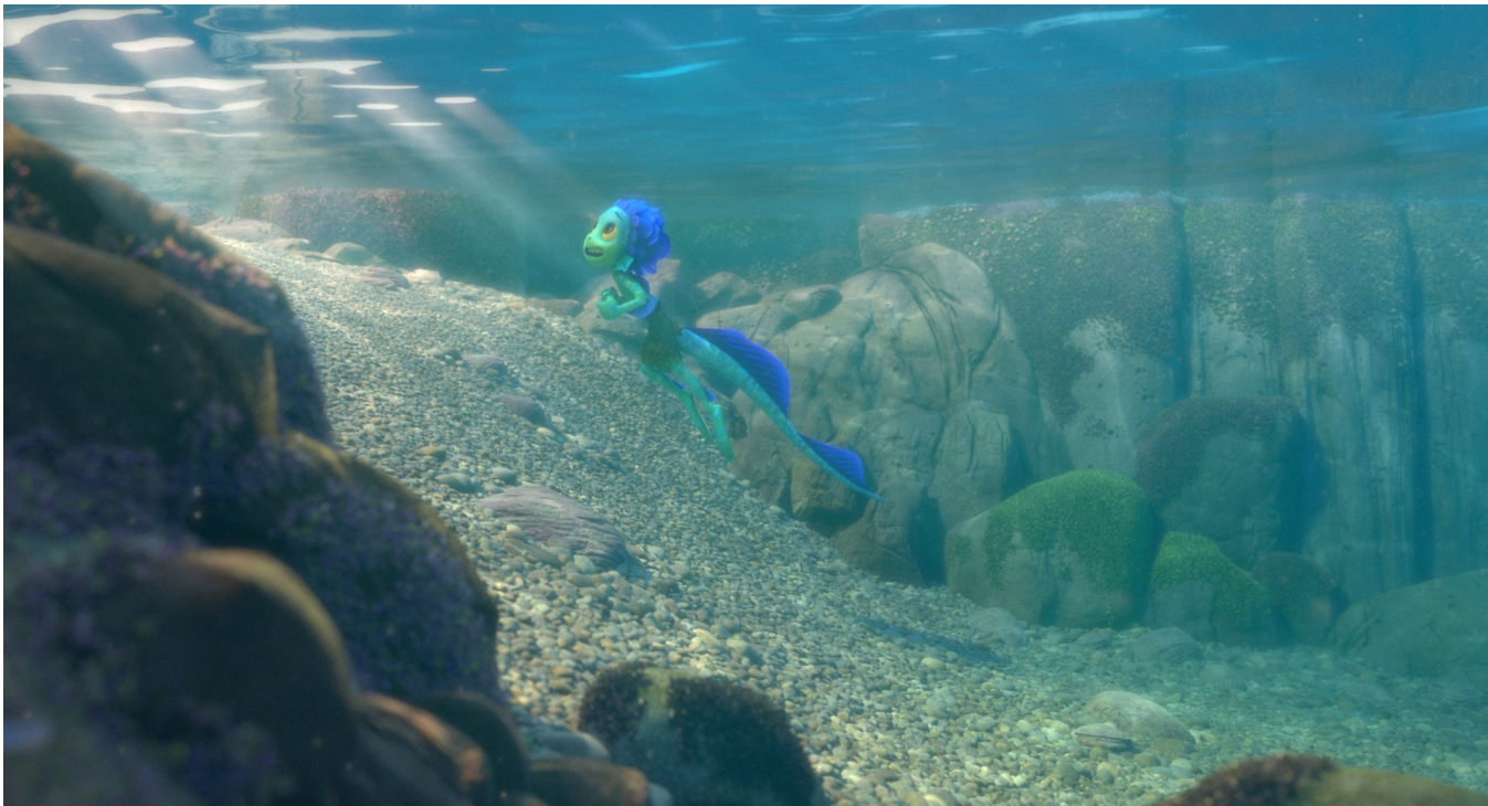
Fog beam layer with aggregate volumes bound to ocean interior, vs final composite - Luca