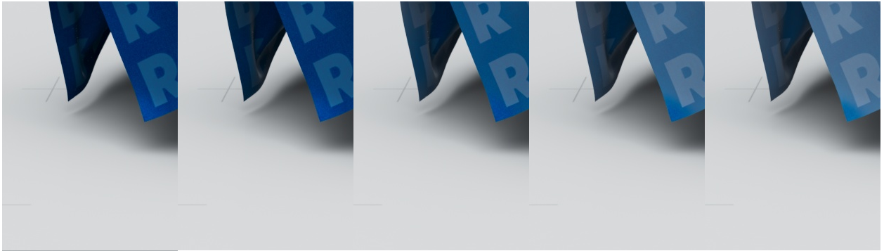
Sheen roughness examples : 0.0 / 0.2 / 0.4 / 0.6 / 0.8 / 1.0