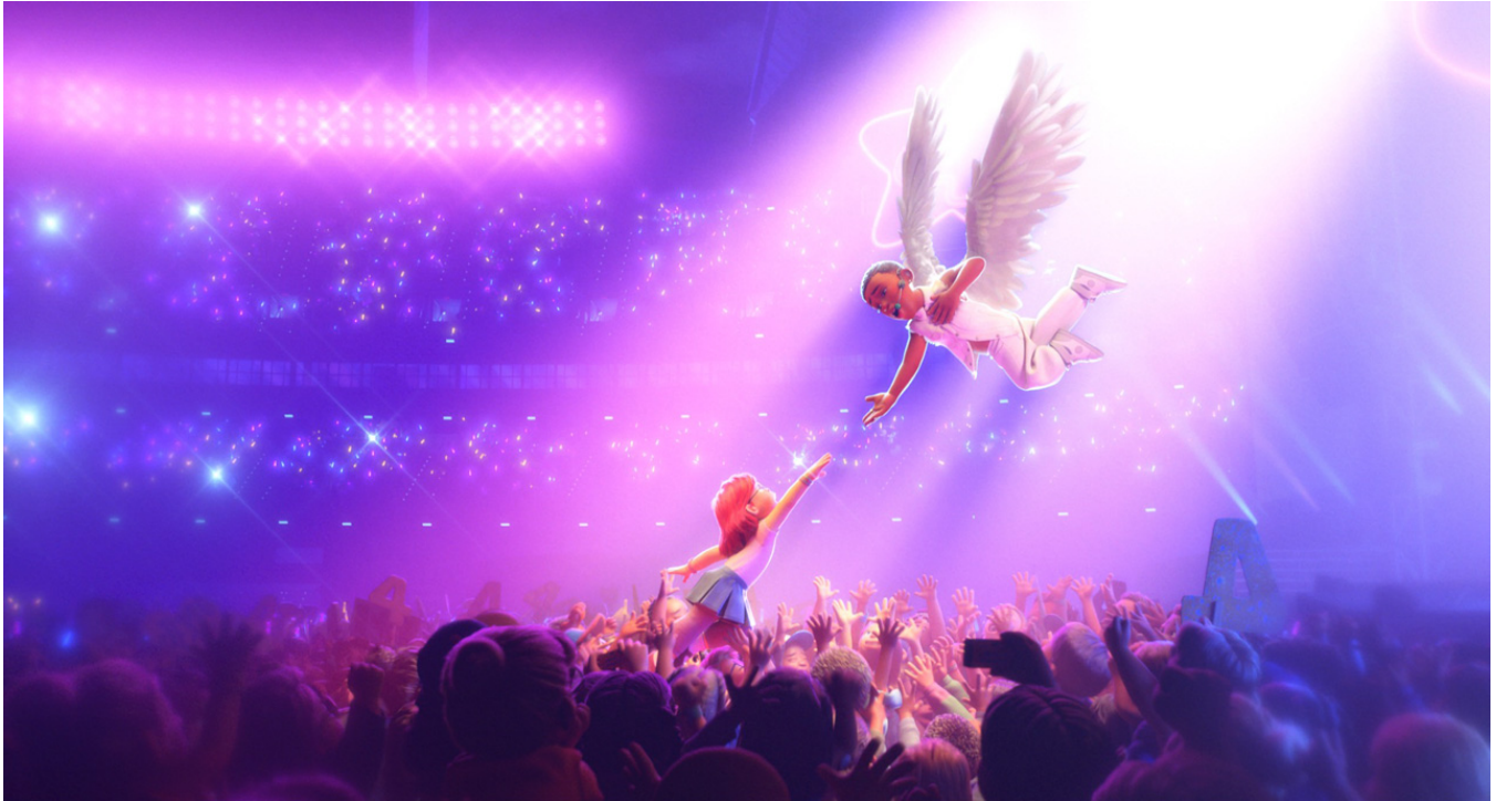
Turning Red

Integrators take the camera rays and return results to the renderer. For the main integrators these are estimates of the light energy (radiance) from the surfaces seen from the outside along the rays. These main integrators are responsible for computing the overall light transport, that is, light that travels from a light source through your scene from object to object (or through objects and volumes) to reach the camera. Interior integrators assist in specialized cases by handling the light within surfaces or volumes. We provide three main production quality integrators, though users can substitute their own.