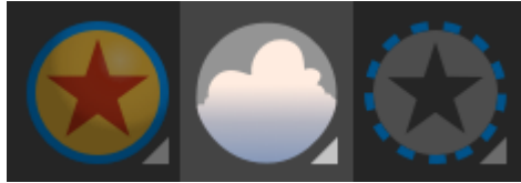
OpenVDB icon in the Maya shelf

OpenVDB is an open source hierarchical data structure for volumes. The OpenVDB Maya plugin ($RMSTREE/plugin-ins/OpenVDB.so) is supported by Renderman for Maya.